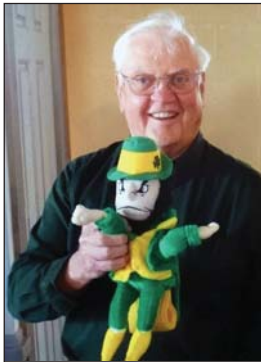
Fun....no strings attached