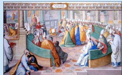
The First Council of Nicaea .

The Christianity we know today is a result of what those men agreed upon over that steamy month, including the timing of our most important holiday, Easter, and Jesus' rising from the dead.