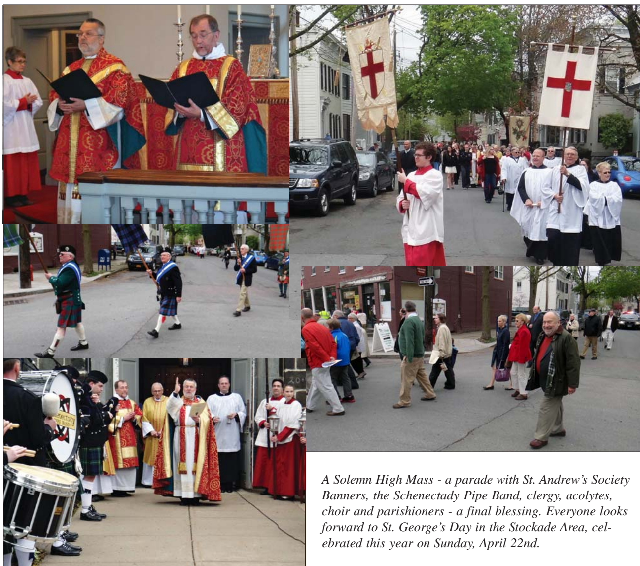
A Solemn High Mass - a parade with St. Andrew's Society Banners, the Schenectady Pipe Band, clergy, acolytes, choir and parishioners - a final blessing. Everyone looks forward to St. George's Day in the Stockade Area, celebrated this year on Sunday, April 22nd.