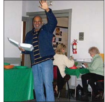
A happy customer