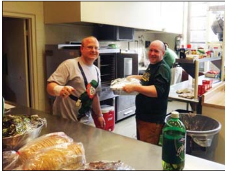
Bill o'fare: corned beef, cabbage & all the trimmings