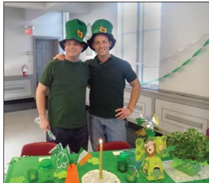
Leprechauns at work