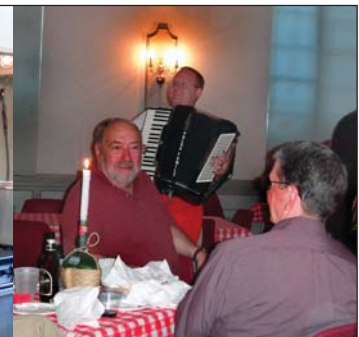
Great food, music and fun for all

PROCEEDS FROM BOTH NIGHTS TO BENEFIT THE ORGAN REFURBISHMENT FUND